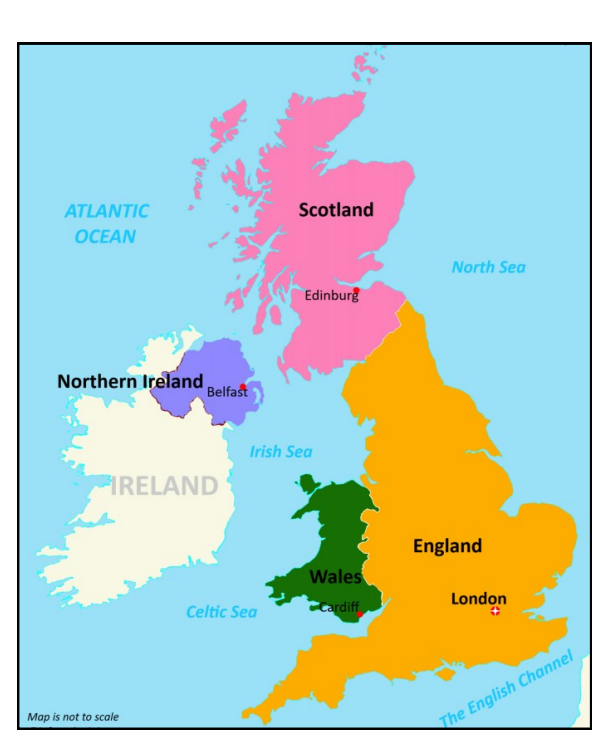
The UK is made up from England, Wales, Scotland and Northern Ireland